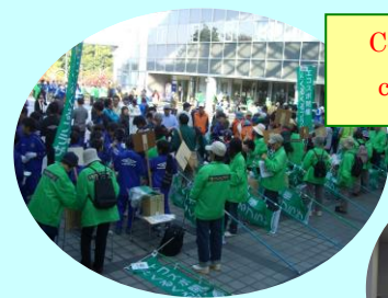
Collaborative project with citizens and businesses

The Citizen Research Institute offers environmental outreach programs at community centers, schools, and other venues, led by our volunteer citizen researchers. These programs cover a variety of topics, including handmade eco-toys, furoshiki wrapping techniques, papermaking, and the essence of the SDGs.