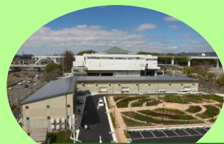
Stockyard (Storage area for recyclable resources )