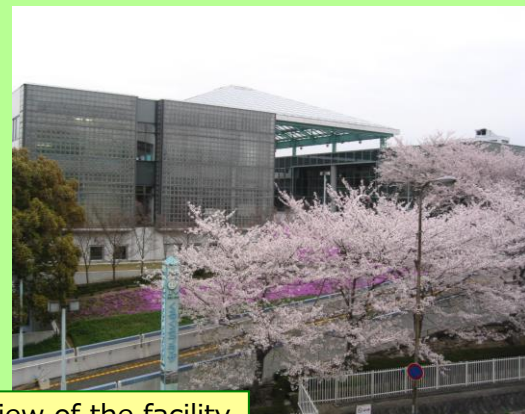
Full view of the facility