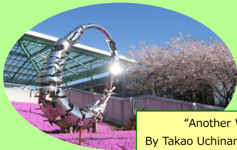
"Another Wheel of Life" By Takao Uchinami, September 1992

located on the 4 th & 5 th floors of Suita City Resource Recycling Center