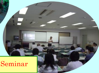
Environmental Awareness Seminar