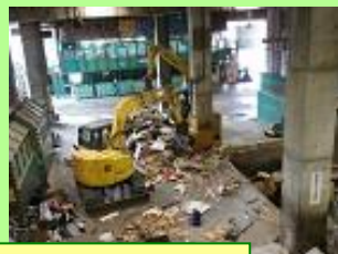
Large-sized waste disposal process